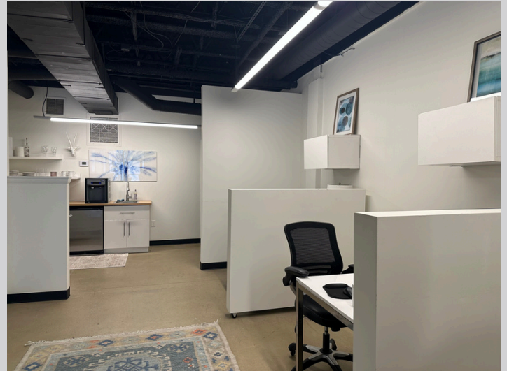
OPEN OFFICE AREA